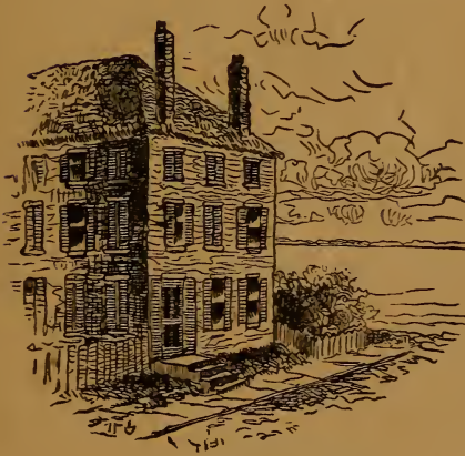
The House in Portland, Maine where Longfellow was born